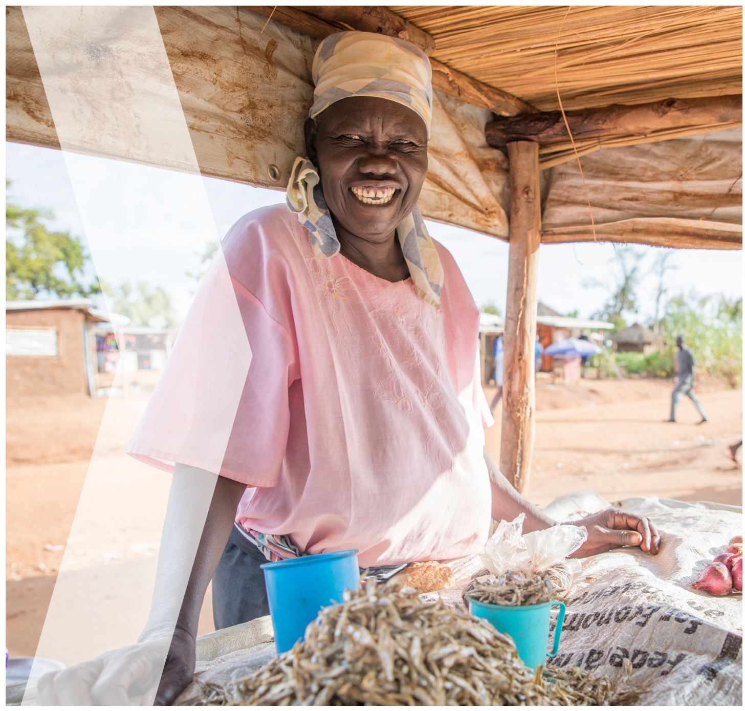
Ezra Millstein/Mercy Corps