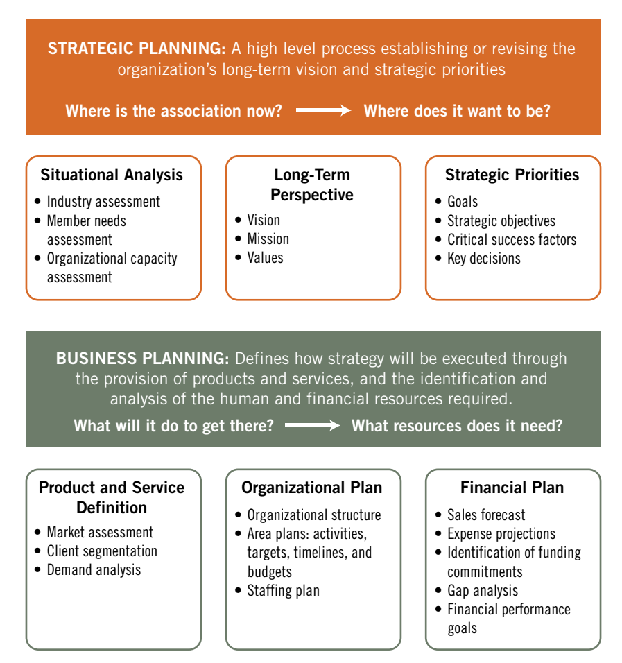
Figure 1. SEEP's Association Planning Model

SEEP's association planning model integrates the principles of alignment, market responsiveness, sustainability , and measurement . It demonstrates the logical and mutually reinforcing relationship between strategic and business planning and provides a sequential framework for analysis and decisionmaking (figure 1). The model is centered on four essential questions: where is the association now; where does it want to be; what will it do to get there; and what resources does it need? It moves from a comprehensive analysis of internal and external environmental factors to the definition of strategic goals and objectives, products and services, organizational requirements, and ultimately to the specification of financial targets.